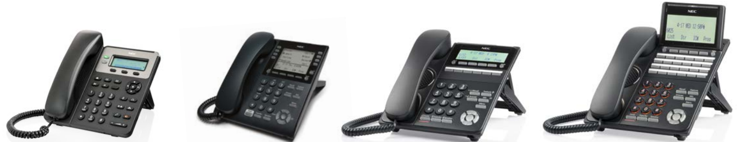
Mono: Easy call control from the office