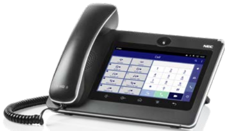
GT890: IP Desktop Video Telephone