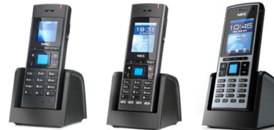
DECT handsets: for any working environment