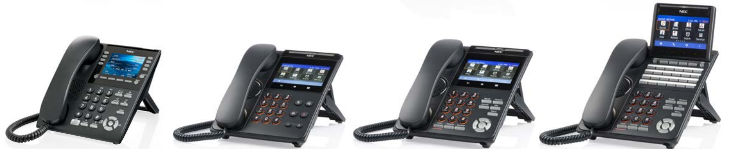
Color: Easy call control from the office, remote or home-based working, hot-desking